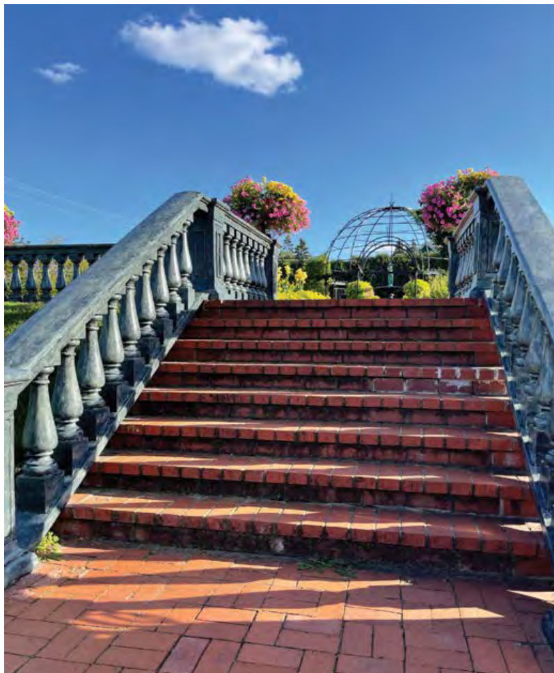
Youth 3rd Hardscape Kaiden Korver - "Stairs to Somewhere"