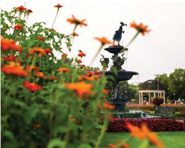
Adult Hardscape 2nd Gamaliel Ferrer - "Sanctuary"