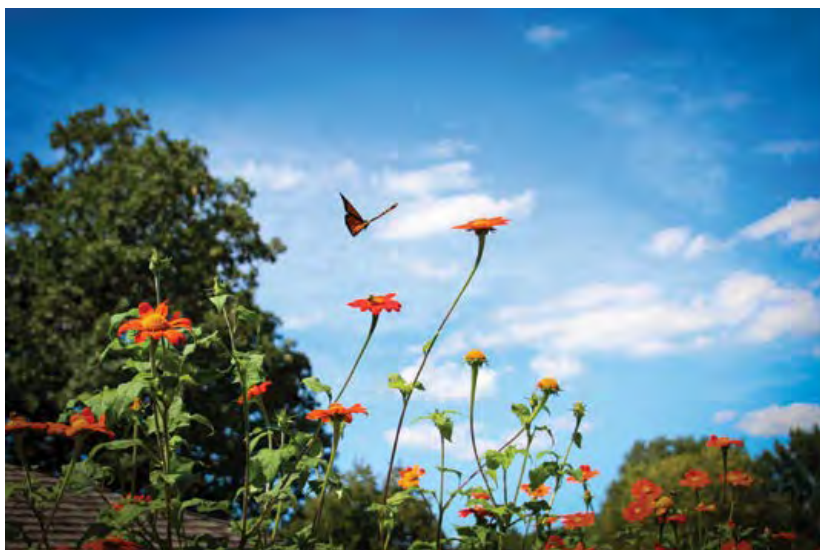
Youth Landscape 1st —Tayah Lackie - "Butterfly in the Garden"—