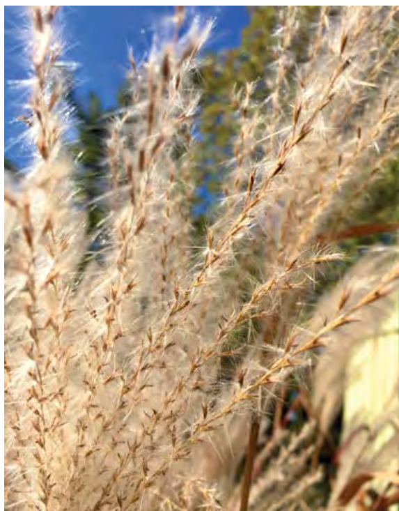
Youth Landscape 2nd —Rachel Brockhouse - "Feathered Grasses"—