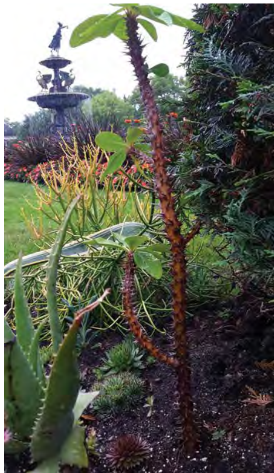
Youth 2nd Hardscape Ami Schneider - "Jenny Crane Fountain"