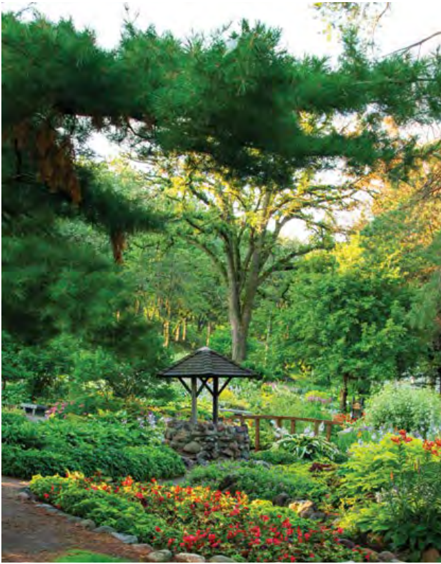
Adult Landscape 2nd Janine Aich-Olson - "Wishes Come True"