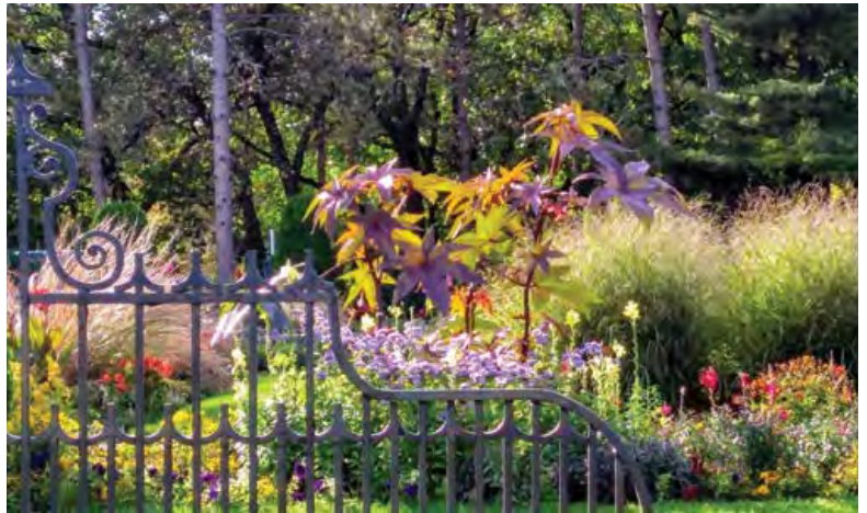
Adult Landscape 3rd Debra Keiser - "Autumn Splendor"