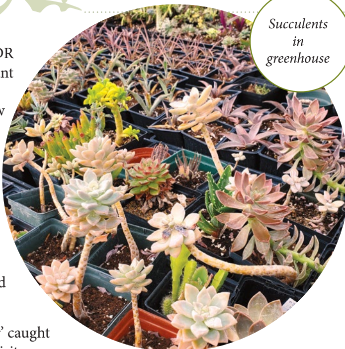
Succulents in greenhouse

Carex 'Testacea' is a sedge with grass like leaves that