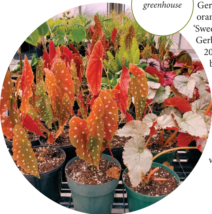
Begonias in greenhouse

Salvia 'Wendy's Wish' has magenta tubular flowers that are also visited by hummingbirds. It grows 2-3' x 2-3' and blooms all summer.