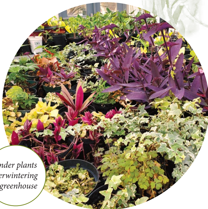
Tender plants overwintering in greenhouse

Many of the tender perennials, succulents and annuals were removed from the gardens and containers to overwinter in the greenhouse. The fountains were turned off and winterized. Fortunately, this happened before the snow!