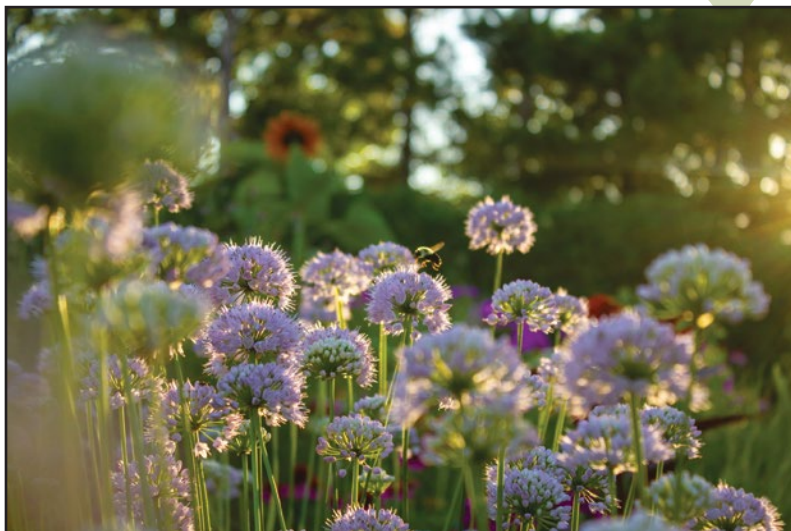
YOUTH SECOND PLACE: Matthew Scherber "Fading Light"