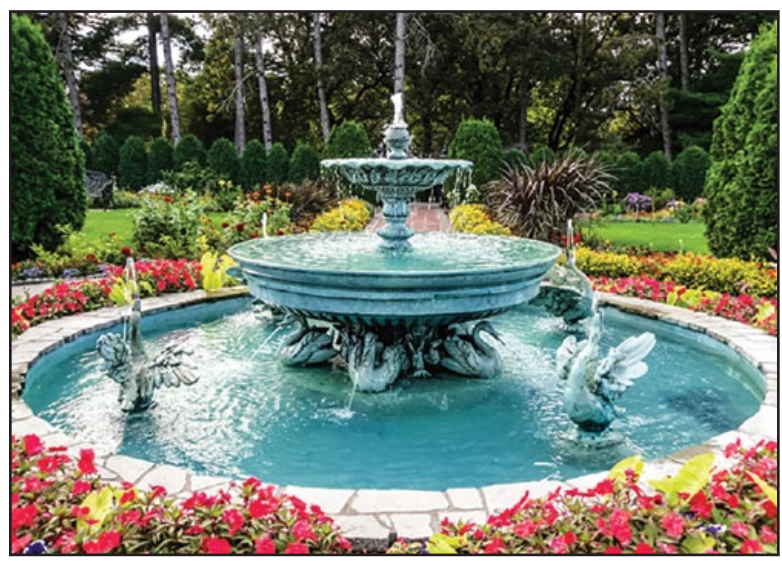
We look forward to seeing the garden returned to it's prior beauty like in this picture.

Major damage to the Gardens happened over the weekend of January