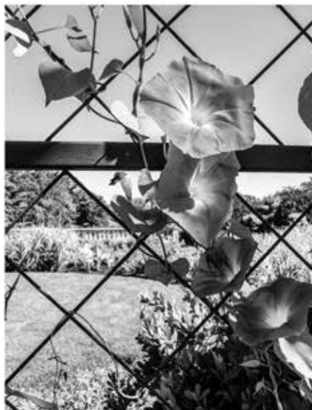
2016 photography winner

This is most obvious in the Perennial Gardens, which have been fantastic this year. Early season bloomers such as peonies, lupines, Siberian iris, and delphinium are done. Right now the