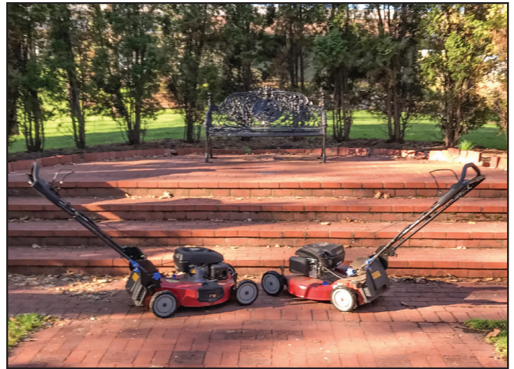
Pictured here are the 2 push lawnmowers.