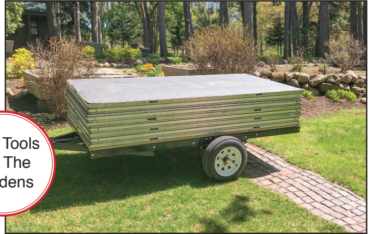
Pictured here is the Trailer