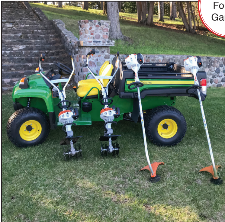
Pictured here are the Gator, weed whips and 2 tillers.

Every year, Munsinger Clemens Botanical Society provides gifts to the Munsinger Clemens Gardens. Your memberships and support of our organization are what makes these gifts possible. We want to thank you for your continued support.