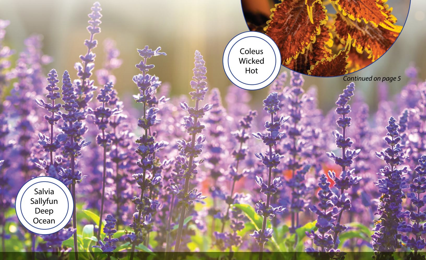
Salvia Sallyfun Deep Ocean