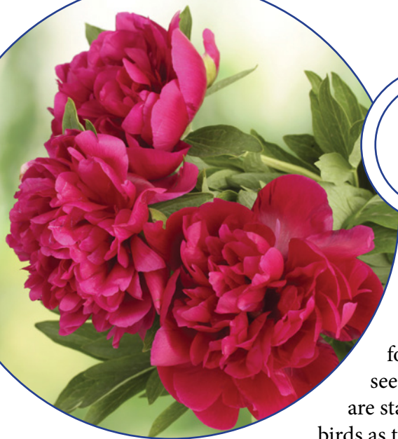
Peony Rubra Plena