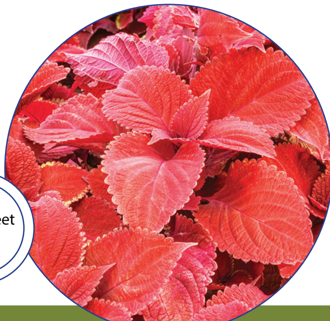
Coleus Main Street Beale Street