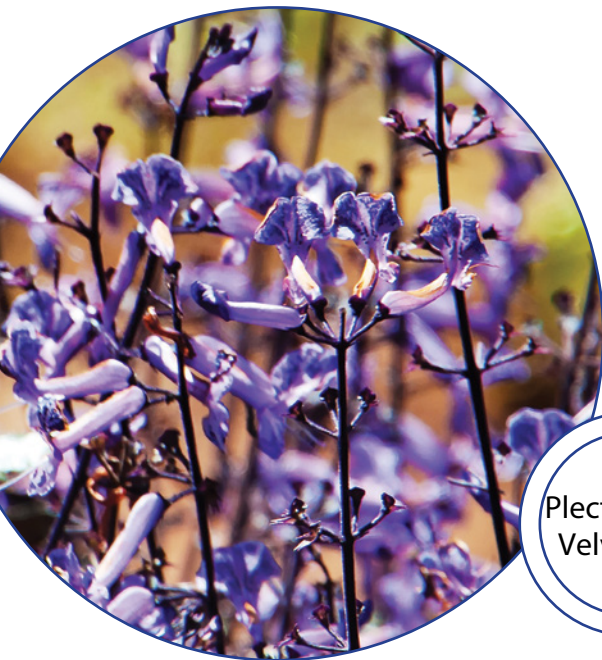
Plectranthus Velvet Idol